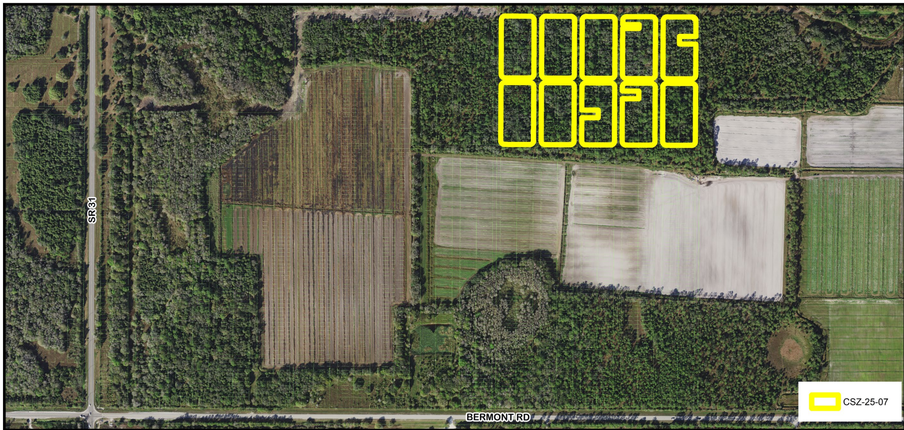
CSZ-25-07 Area Image (Mid-Range)