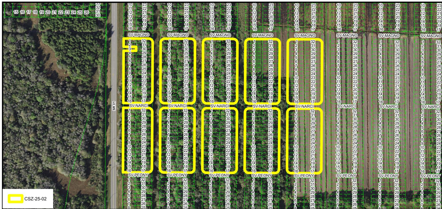
CSZ-25-02 Area Image