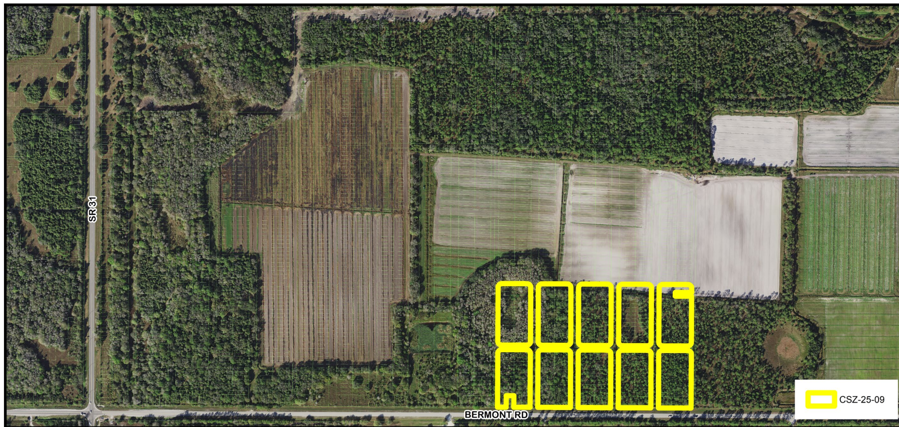
CSZ-25-09 Area Image (Mid-Range)