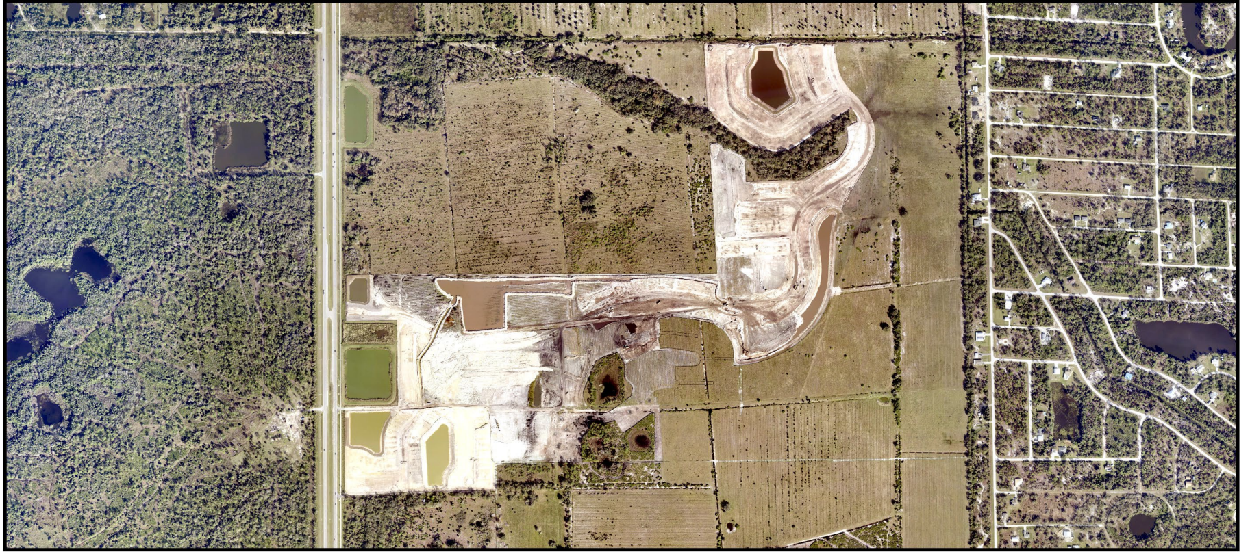
DRC-24-188 2024 Eagle View Image