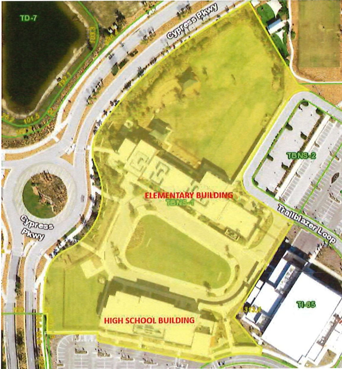
EXHIBIT A FACILITIES