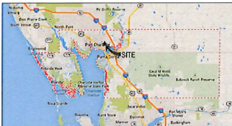
GENERAL LOCATION MAP

23100 BONITA GRANDE DRIVE, SUITE 102 BONITA SPRINGS, FL 34135 PHONE: (239) 237-0517